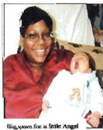
Big, sassy for a little Angel

well as her Couple's dreams came true when Baby Angel was born weighing 8lb 9oz.