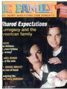
Shared Expectations Surrogacy and the American Family