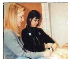
Mommy checking her baby's heart rate